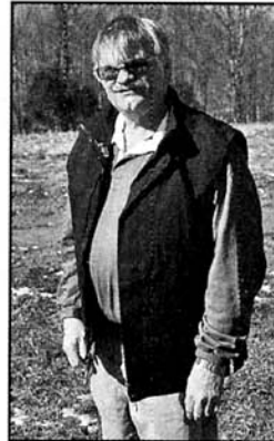
The SCOTTVEST (SeV).

This vest is particularly well designed for those working protective details or for other law enforcement needs since it incorporates channels to run wires from a radio to an earpiece or microphone. Additionally, it incorporates 28 pockets or compartments, most of them internal for carrying cellphone, knife, palm pilot, GPS, compact medical kit, handcuffs, passport, various currencies, and any other