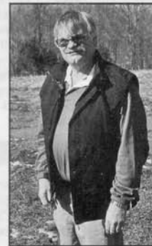
The SCOTTVEST (SeV).

This vest is particularly well designed for those working protective details or for other law enforcement needs since it incorporates channels to run wires from a radio to an earpiece or microphone. Additionally, it incorporates 28 pockets or compartments, most of them internal for carrying cellphone, knife, palm pilot, GPS, compact medical kit, handcuffs, passport, various currencies, and any other