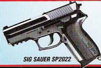
SIG SAUER SP2022