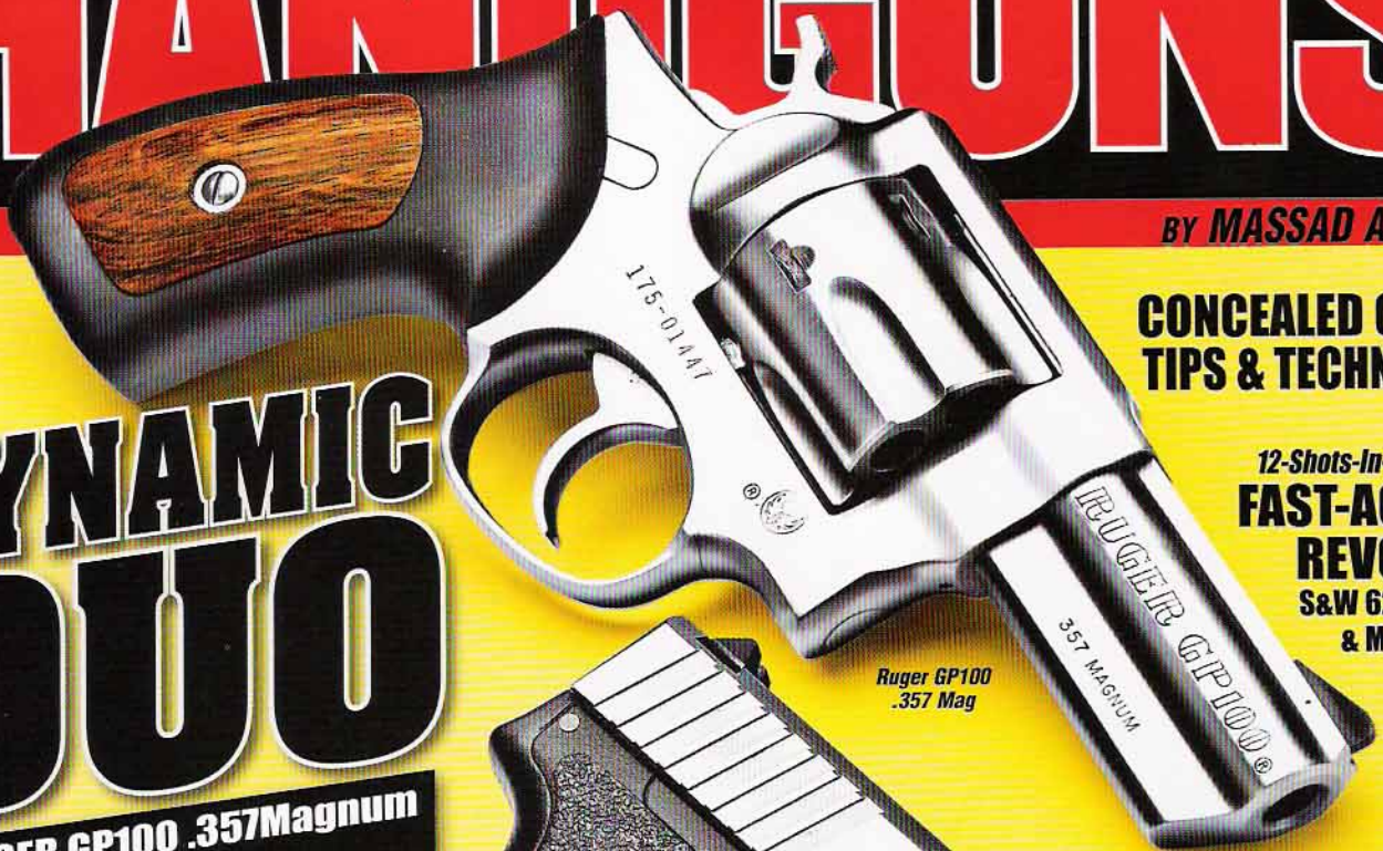
Ruger GP100 .357 Mag